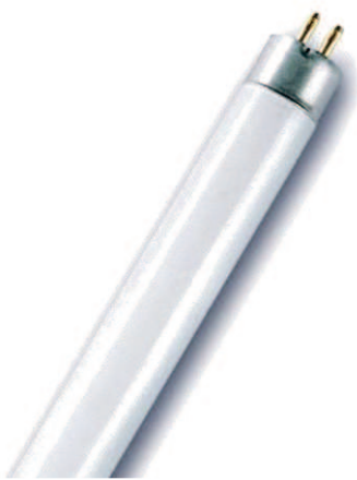
LUMILUX ® T5 HE