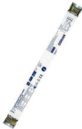
QTi DALI/DIM / QTi GII / QTP5