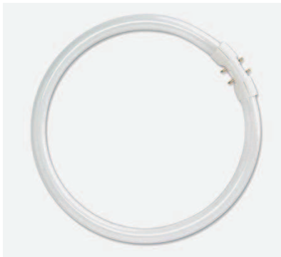
LUMILUX® T5 FC®